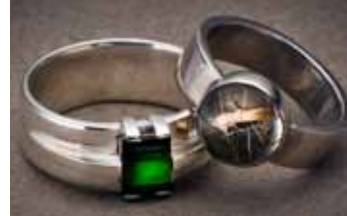
Bob Smith, student

Sept 18 - Nov 27; 10am - 1pm Basic and above; Jewelry 1 skills required $495 (Early Bird: $470.25); $55 kit