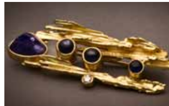
Minou Palandjian, student

Jan 8 - Mar 12; 10am - 1pm Basic and above; Jewelry 1 skills required $425 (Early Bird: $403.75); $60 kit