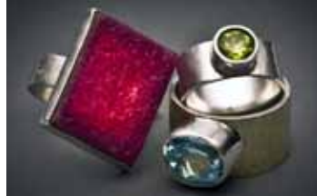
Ellen Carno, student